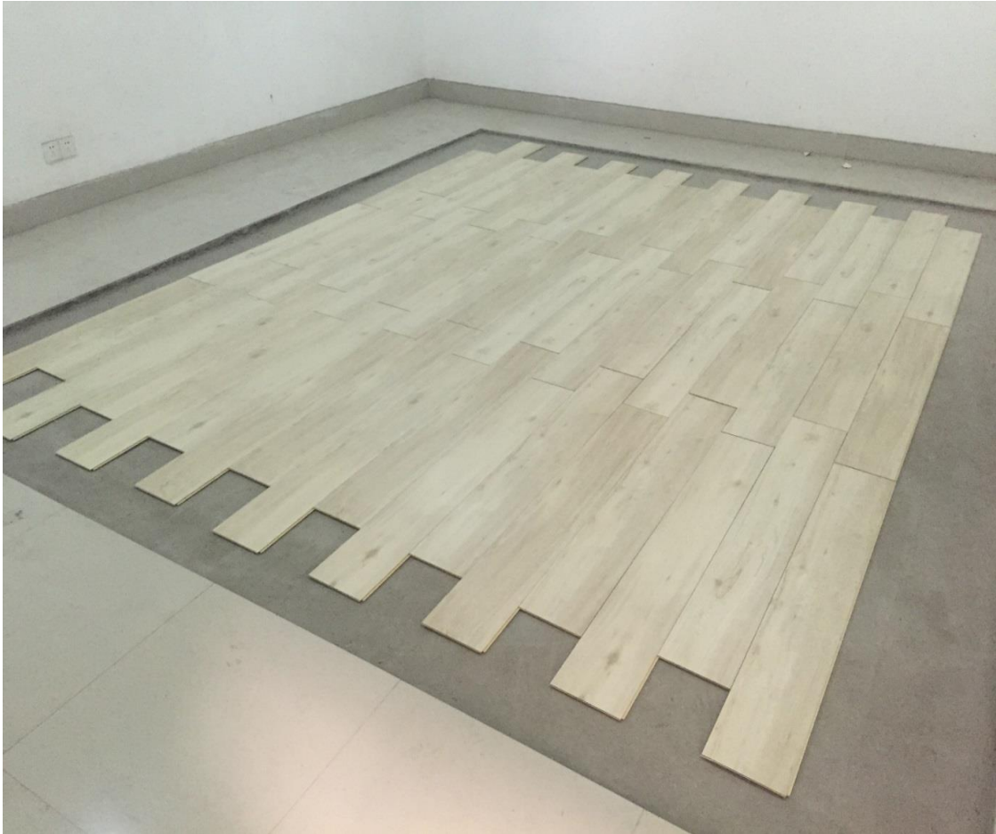
Test set up