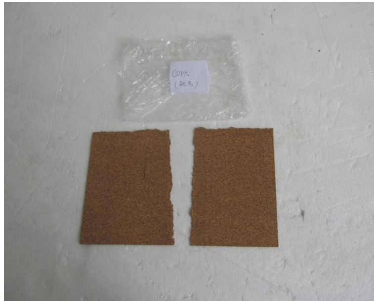
Fig1. Sample as received